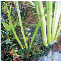
Redroot (left), Blue Flag Iris (right)

The vegetative plant can look similar to Redroot ( Lachnanthes caroliانا , page 12) and small Blue Flag Iris ( Iris versicolor ), however both these plants have white underground stems (rhizomes) rather than red. Golden Crest leaves are a paler blue-green than Redroot and are often somewhat hairy in their lower half.