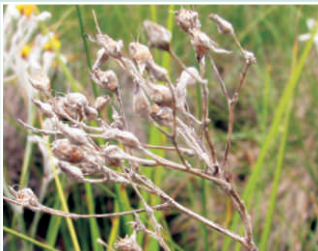
Dried flower stalks