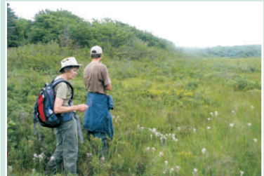
Golden Crest wetland

Interesting Point: Can be recognized by its dried flower stalks from the previous year.